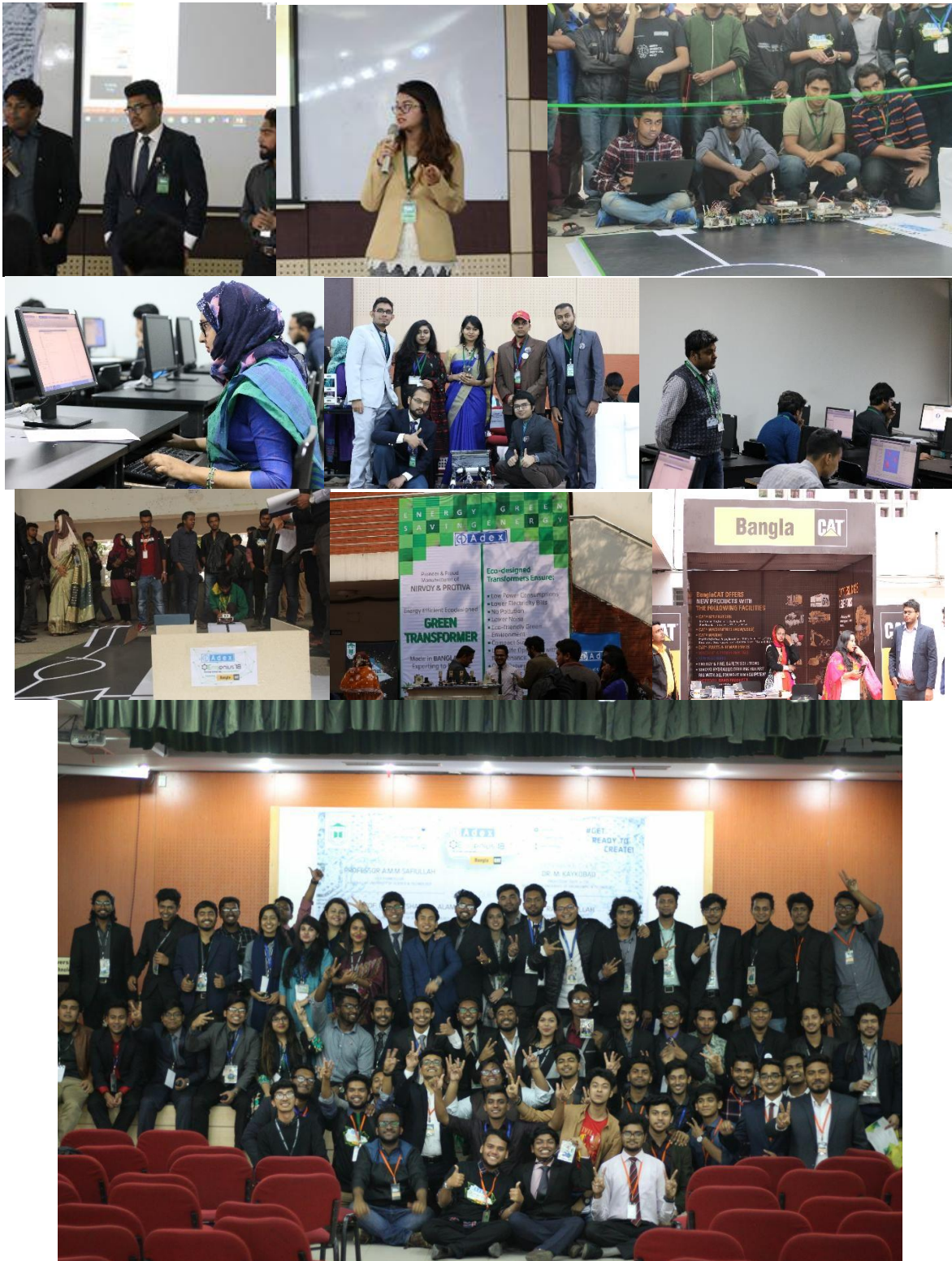
Some moments of the ADEX ENGENIUS '18