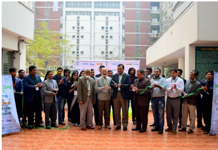
Inauguration program of the ADEX ENGENIUS' 18