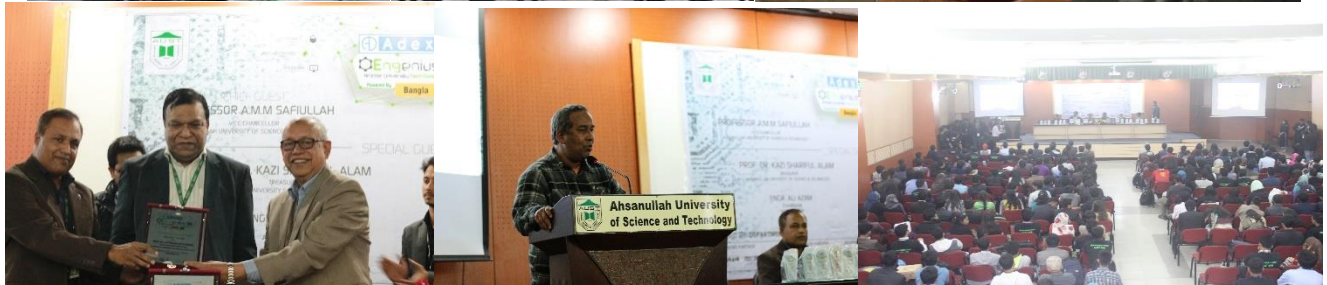
Glimpse of the Prize giving Ceremony