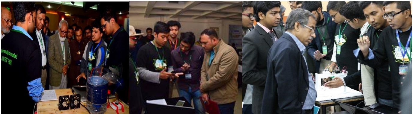
Judges and Guests are discussing with the participants