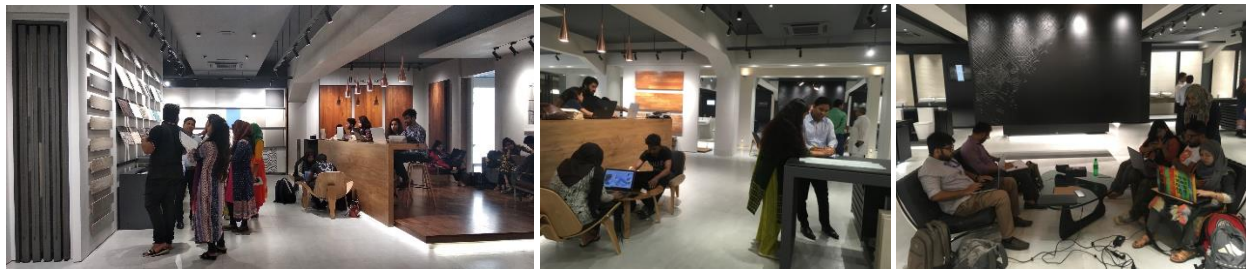
Figure: Student activities during the workshop

Considering these issues, a half-day long workshop and field visit to one of the prominent showrooms of interior materials, 'PMG Gallery' at Tejgaon, Dhaka was organized for the students of 4 th year 2 nd semester of the Department of Architecture of Ahsanullah University of Science and Technology (AUST) to have an up-to-date idea about the recent trends of interior design practices and presently available materials. The visit was organized as part of the Interior Design Studio (ARC 4206) and took place on 13 th March, 2019 from 2.00 pm to 7.00 pm.